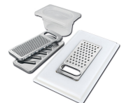
graters kit with ring- holder and food collection tray 8159 101