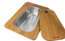
iroko-wood chopping board with stainless steel colander 8644 042