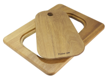
iroko-wood sliding chopping board 8644 041