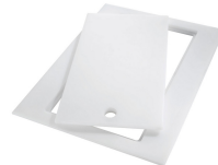
hpde twin chopping board 8644 101