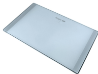
glass chopping board 8631 300