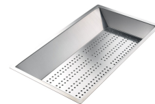
stainless steel perforated tray 8151 000