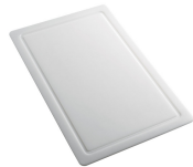
hpde chopping board 8657 001